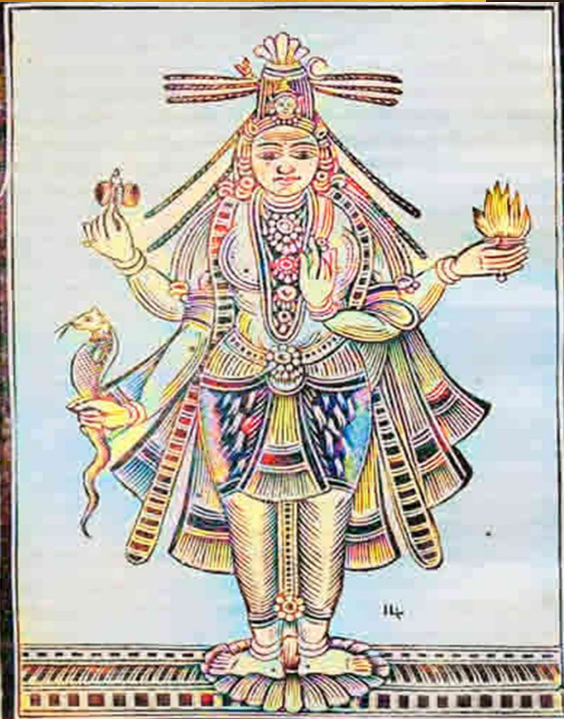
14. Bhujanga Trasa Murthy