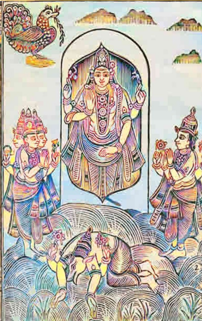
2. Lingodbhava Murthy