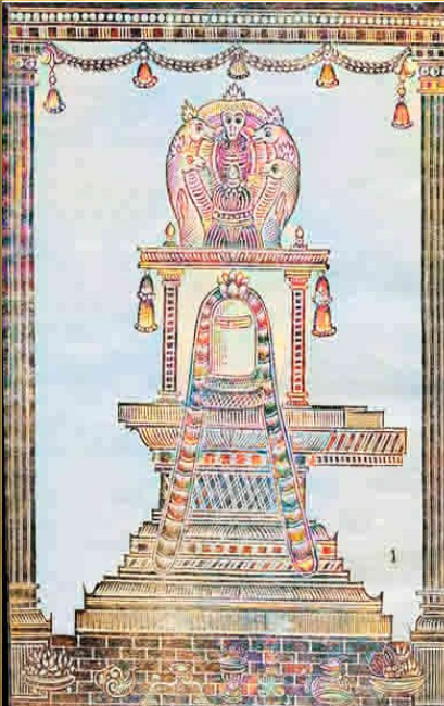
1. Linga Murthy