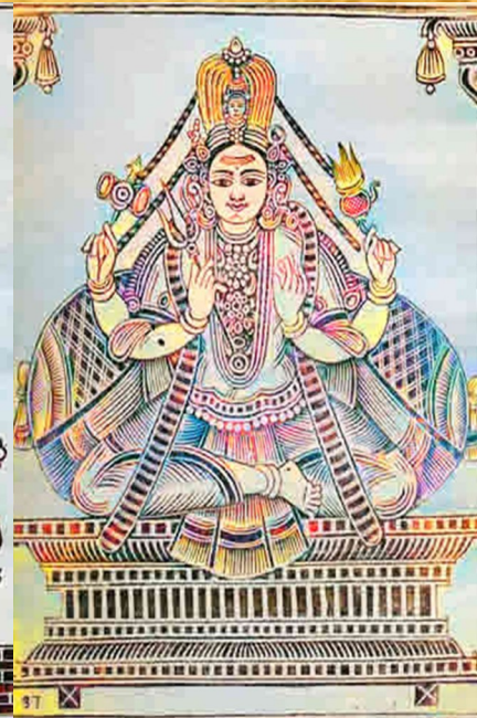
37. Lakulishvara Murthy