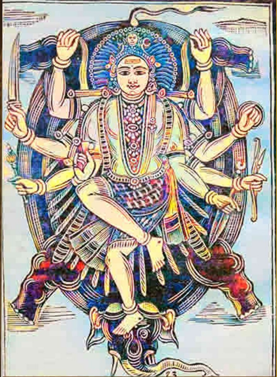
23. Gajasura Samhara Murthy