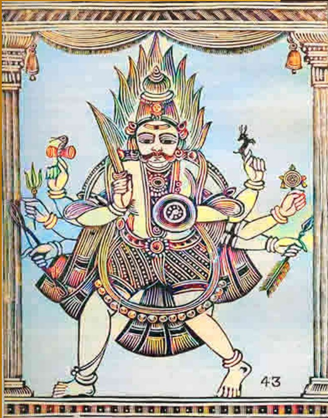
43. Agorashtra Murthy

© 2023 Sri Nithyananda Paramashivam. All Rights Reserved