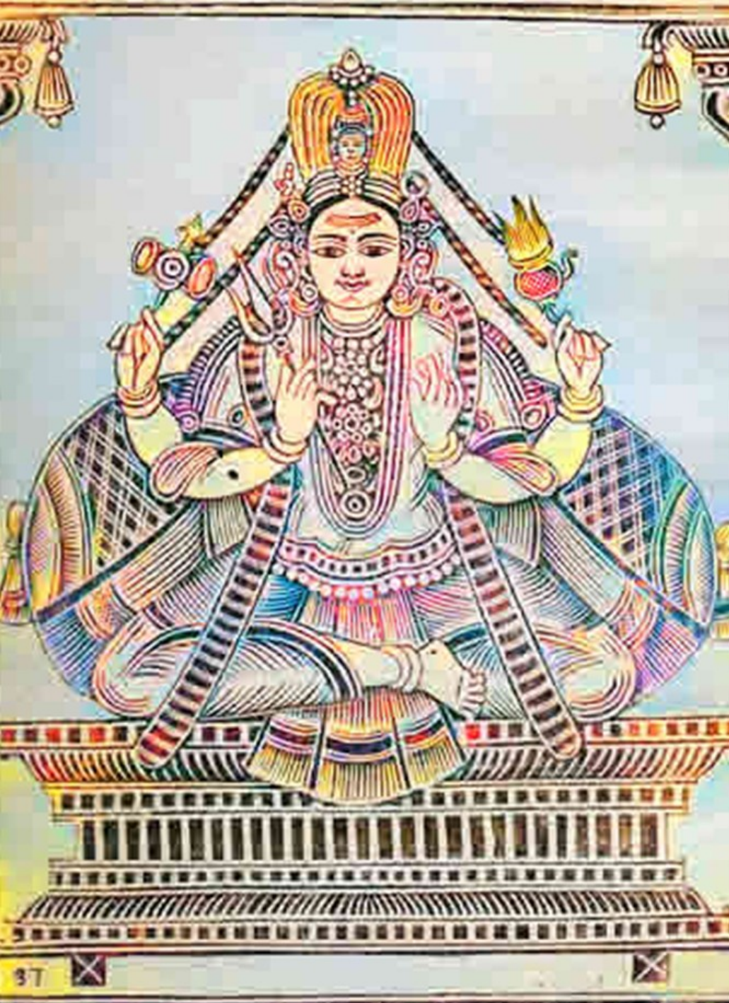
37. Lakulishvara Murthy

Person who understand anti-matter matters for life, starts making the cognitions related to anti-matter.