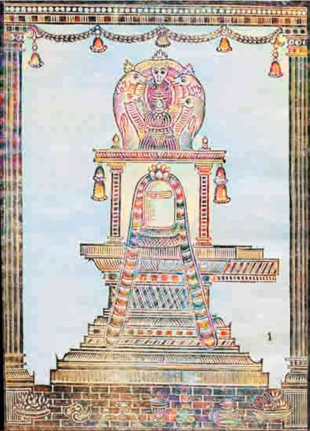
1. Linga Murthy

If you understand all your components, you can see very clearly every moment Big Bang and Black Hole is happening in your system.